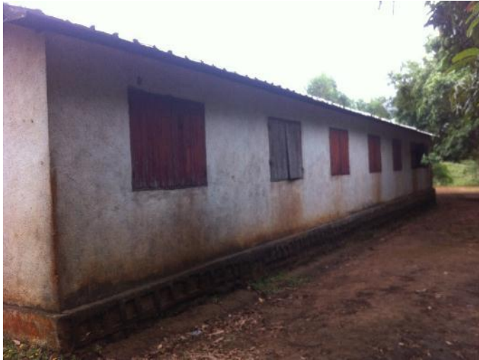
Old Foundations 2019