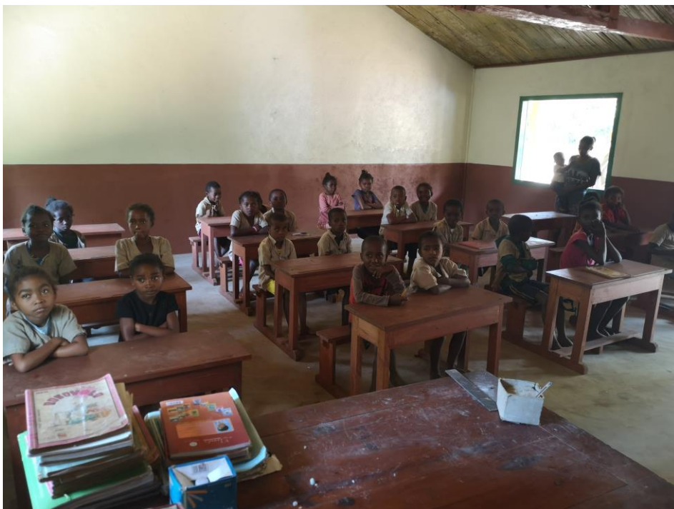
Children at School for the 1 st time.