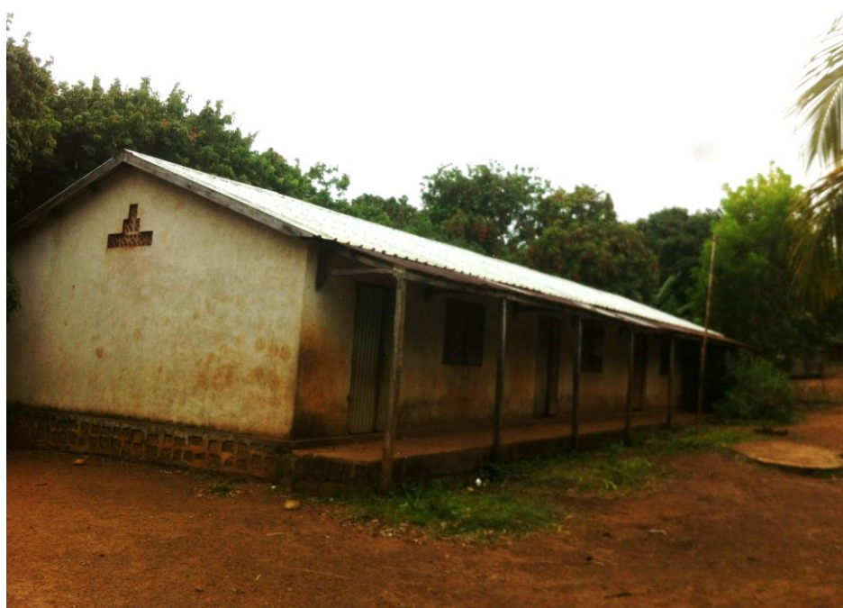
Front (North view) 2019