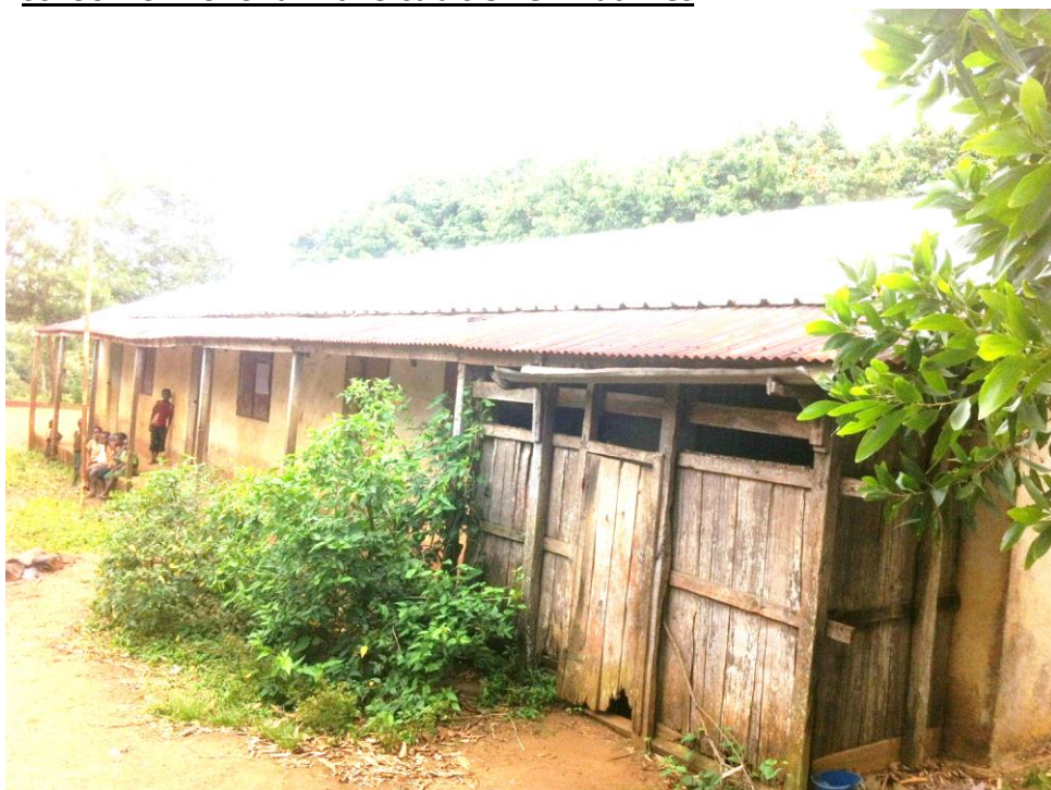
Front (South view) 2019