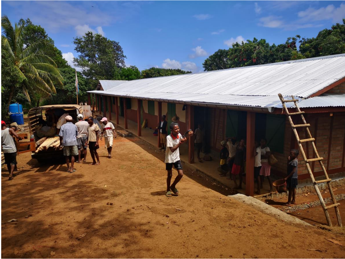
The new School at Nohona 2020