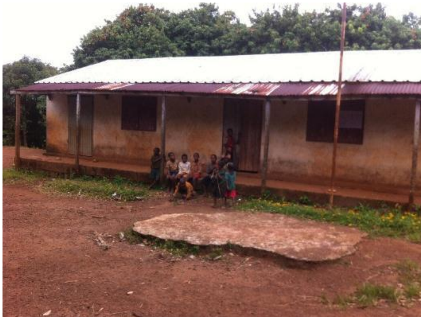
Rear view and front view of the school. 2019