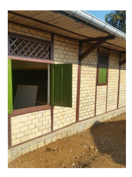
Rear Elevation of 1 classroom

The compound is surrounded by a living fence cleared and planted by the community.