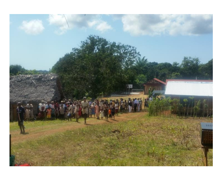
New school in the background