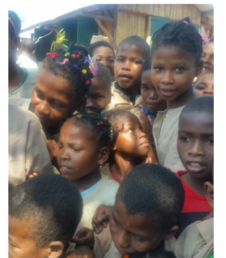
The children at their 1st day at school