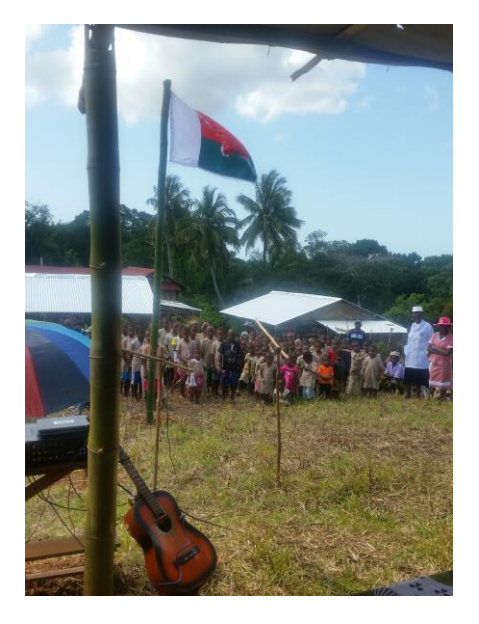
The Mayor's guitar and teacher's houses