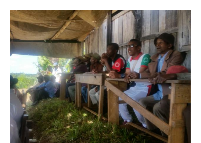
Local Mayor and Kings