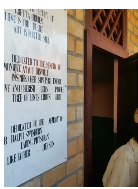
One of 6 new classrooms.