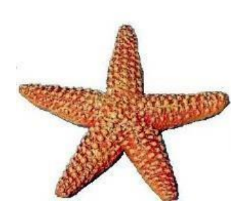
Issue No 8 Newsletter November 2016 www.tascmadagascar.org