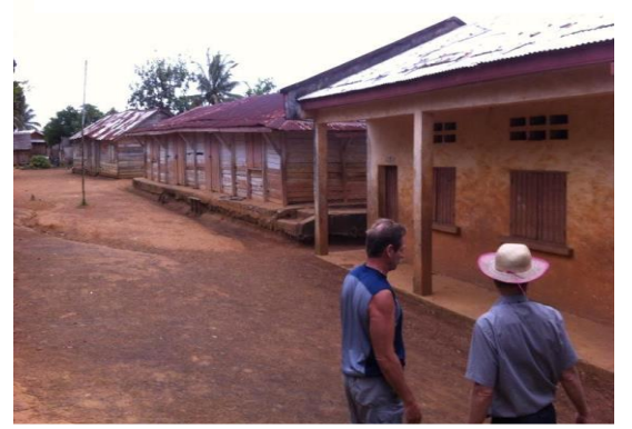
Education, Education, Education.