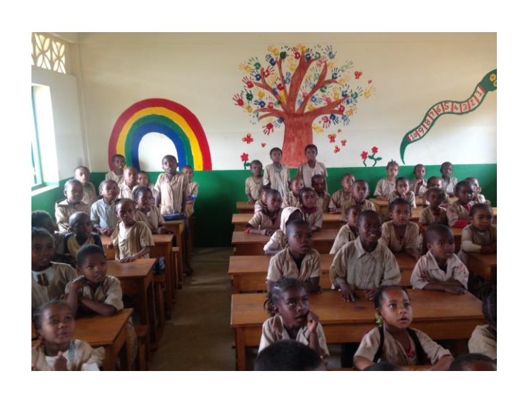
Left - children at Maromby School,

TASC believe the most important thing to do to help Madagascar is to provide primary school children with access to good education. Over the last ten years Madagascar has moved closer towards reaching its goal of primary education for all, but many challenges still remain. Only 60 out of every 100 children who enter the first grade complete their primary school education, this situation needs to improve and that is why TASC has teamed up with The Adsum Foundation and are treating education as our number one priority. Above is our completed primary school at Maromby for 320 children. The second primary school at Salohy, which is a more rural school for 220 children has been started and will be opened in the spring of 2017. With a third primary school at Andasy being started shortly after, once funds are found.